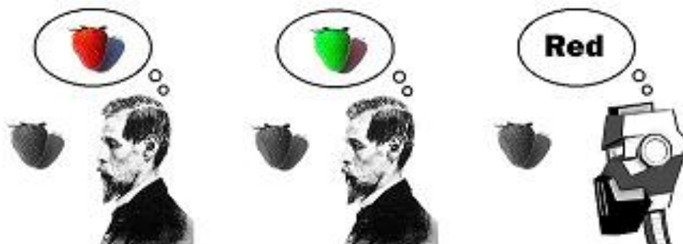
Figure 1. The difference between phenomenal and abstract systems, represented by two humans and a robot. Though the first two systems represent red information with different qualities, they are both like something. The 3rd represents red with a word. It needs a dictionary to know what red means.

the chain of perceptual events. Imagine the inversion happening immediately after the retina that turns the signals normally associated with red light into a green signal. This would demonstrate that the nature of this red light landing on the retina has nothing to do with the physical fact that your knowledge of the strawberry might have a greenness quality. The abstract notion of red can be represented by any set of physical properties in the chain of perception. The only thing that matters is the final interpretation where the brain decides what quality to render into conscious knowledge. People that suffer from Achromatopsia (who see everything as black and white) are going to use very different qualities to represent visual knowledge.