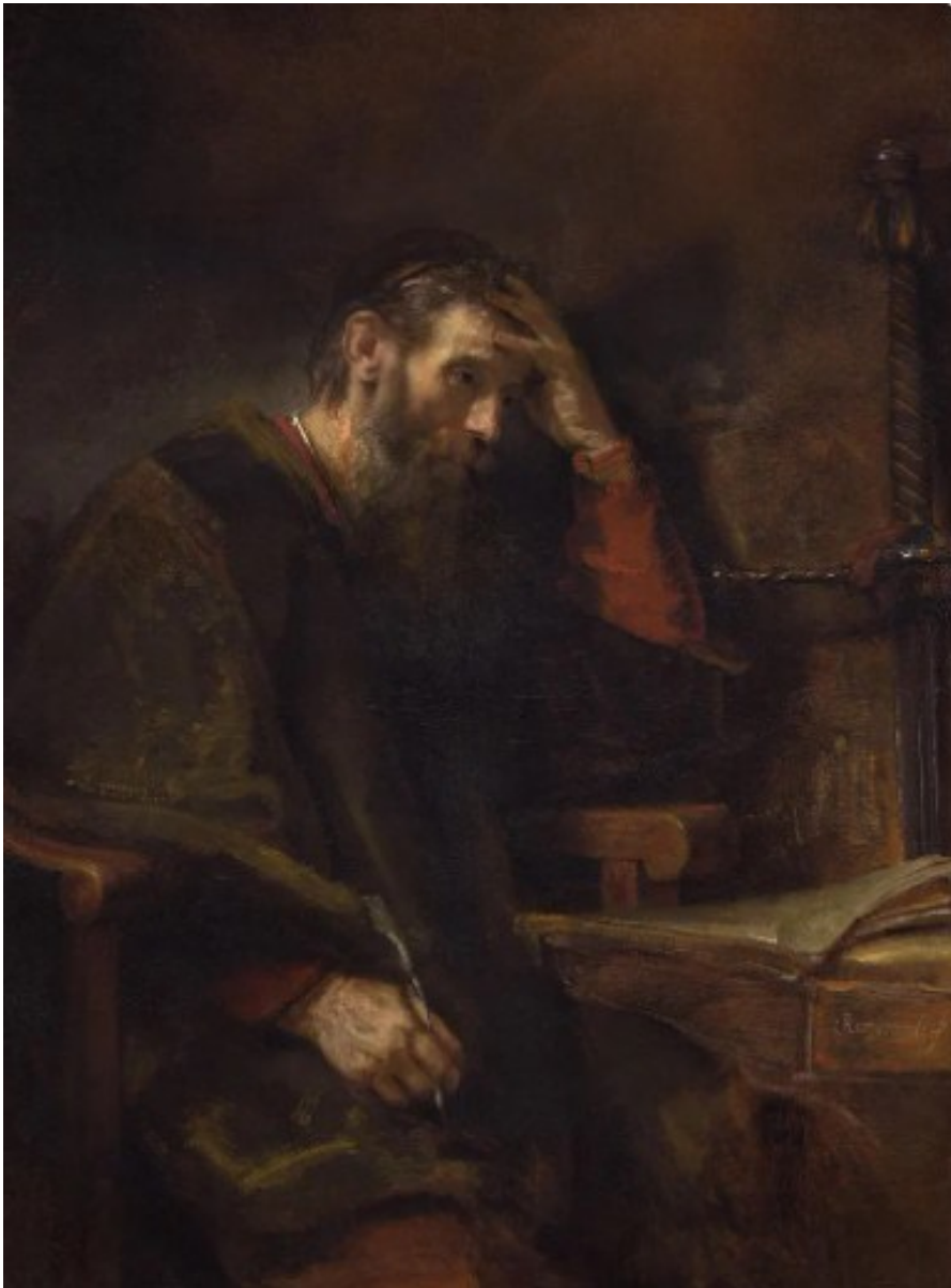
Rembrandt's famous painting on St. Paul

The present paper focuses on one of such illuminating visions: the one experienced by St. Paul (c.5 – 65 AD) as documented by Luke the Evangelist in the New Testament's Acts of the Apostles, Chapter 9, and recollected by Paul himself in Chapter 22. The paper places this event in the context of one of its most important results: the protection of Paul by the Jewish king Agrippa II who had nothing to do with Christianity yet made possible for Paul to continue spreading Jesus' system of teachings.