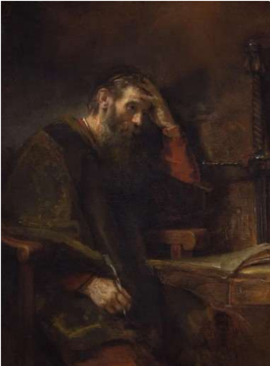
Rembrandt's famous painting on St. Paul

The present paper focuses on one of such illuminating visions: the one experienced by St. Paul (c.5 – 65 AD) as documented by Luke the Evangelist in the New Testament's Acts of the Apostles, Chapter 9, and recollected by Paul himself in Chapter 22. The paper places this event in the context of one of its most important results: the protection of Paul by the Jewish king Agrippa II who had nothing to do with Christianity yet made possible for Paul to continue spreading Jesus' system of teachings.